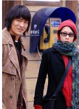
L: Andy Lau , Hong Kong R: Rene Liu , Taiwan