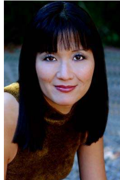
Suzanne Whang Actress, Comedian, TV Host